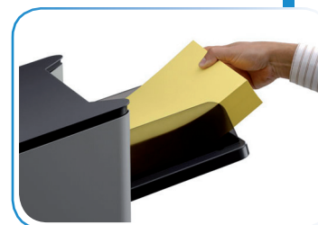
High-capacity Document Feeder holds up to 725 sheets and multi-page sets