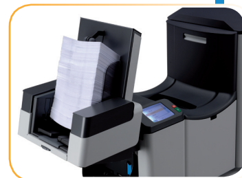
High-capacity Vertical Stacker holds up to 500 filled envelopes