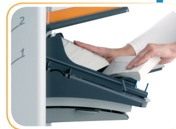
Optional Production Feeder holds up to 325 BREs

Formax - New Hampshire, USA www.formax.com